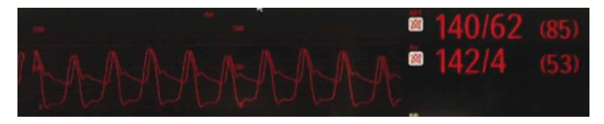
Figure 3. Post-procedural transvalvular gradient.

mismatch, of malpositioning and of coronary occlusion. The first risk is frequently reported in patients with degenerated small bioprostheses (<23 mm): implantation into 23 mm xenografts can be recommended only for patients with a body surface area less than 1.8 m<sup>2.5</sup> In this reported case, the degenerated valve is a Mitroflow pericardial valve: this valvular system has an inner true diameter of 19 mm, an outer diameter of 22.6 mm and a height of 14 mm, so it might accommodate a 23 mm Lotus transcatheter valve. The sizing of the device is extremely important: undersizing increases the risk of paravalvular leak and/or migration/embolisation, while oversizing may lead to geometrical distortion of the transcatheter valve leaflets. The VIV International Data (VIVID) Registry reported an incidence of 3.5% of coronary obstruction<sup>1</sup>. Arguably, this phenomenon may be underestimated because coronary obstruction can be incomplete or mitigated by patent bypass grafts. The risk is increased during treatment of degenerated Mitroflow bioprostheses where the leaflets are mounted externally to the stent, thus