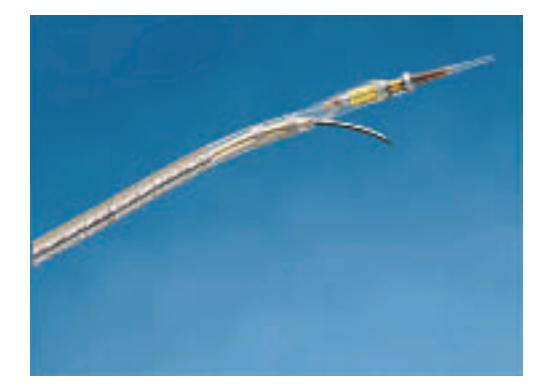
Fig. 1: Pioneer crossing device TransAccess double lumen catheter with puncture needle and integrated phased array 20 MHz IVUS transducer.

nostic catheter (Glidecath, Terumo, Tokyo, Japan) was advanced with the tip in the area of the reconstitution segment of the superficial femoral artery (Figure 2). After exchange for a long 0.014" guide-wire the catheter was removed. In patients with severe calcification, predilatations of the subintimal space with an undersized low profile balloon (Submarine, balloon diameter 4 mm, length 80 mm, Invatec, Roncadelle, Italy) were carried out to facilitate the following introduction of the Pioneer crossing device to the reconstitution segment of the vessel. After identification of the true vessel lumen by IVUS and colour-flow imaging, the catheter was rotated to bring the vessel lumen to a 12 o'clock position on the IVUS image (Figure 3). After selection of the introduction depth of the puncture needle at the handle bar of the device (usually 5 mm), the true lumen was punctured and a second long 0.014" guide-wire was advanced through the nee-