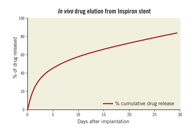
Figure 1. Drug release kinetics of the Inspiron sirolimus-eluting stent.

The primary endpoint of the study was in-segment late lumen loss at six months by quantitative coronary angiography (QCA). Secondary endpoints included in-stent late loss, binary restenosis rate, percentage diameter stenosis, and in-stent percentage volume obstruction on IVUS. Secondary clinical endpoints were a composite of major adverse cardiac events (MACE), including cardiac death, Q-wave or non-Q-wave myocardial infarction, clinically driven surgical or percutaneous revascularisation of the target lesion or vessel at 30 days, six months, 12 months, and 24 months after the index procedure. All of the serious adverse events were submitted to an independent adjudication committee. QCA and IVUS analyses were conducted by an