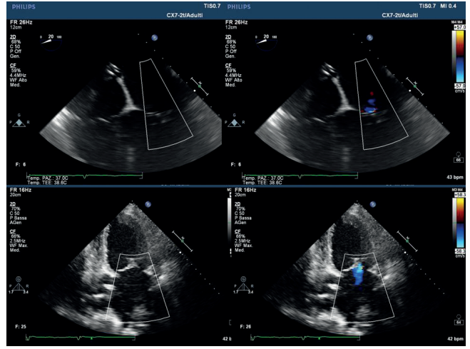
Figure 4. TTE , better than TEE , documented the good result of the clip positioning .

To date, of the 8,000 patients in the world<sup>10-12</sup> treated with a MitraClip<sup>TM</sup>, to our knowledge this is the first case demonstrating