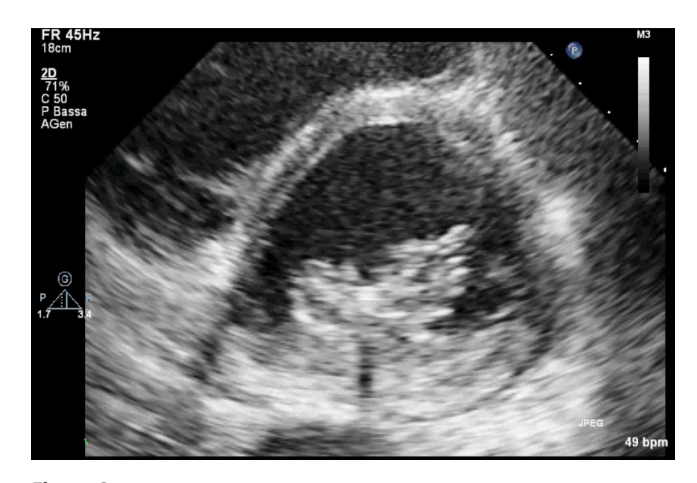
Figure 3. TTE parasternal short-axis view showed a centrally positioned clip, fully grasping the rear edge, with an 8-shaped symmetrical loop of the mitral valve in diastole.

pre-discharge echocardiogram confirmed the success of the procedure with mild residual mitral regurgitation.