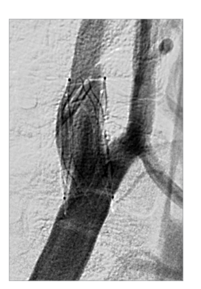
Figure 3. Angiography of the right carotid artery after implantation of the device.

A 30-day follow-up with twice daily ambulatory blood pressure monitoring showed an average blood pressure of 128 over 93 mmHg (Figure 2). Ten weeks after implantation, an ambulatory 24-hour blood pressure monitoring revealed normal blood pressure with a mean of 113 over 70 mmHg during the day and a mean of 107 over 60 mmHg during the night. This compared favourably to the pre-procedure 24-hour readings of 183 over 114 mmHg during the day and a mean of 181 over 109 mmHg during the night. After the device implantation no significant changes in heart rate were observed (average heart rate of 77 bpm and 68 bpm before vs. after the procedure, respectively). During follow-up after the device implantation, labetalol was stopped, and furosemide and spironol-actone doses were reduced. Her present medications are furosemide 40 mg twice daily; spironolactone 50 mg twice daily, and valsartan